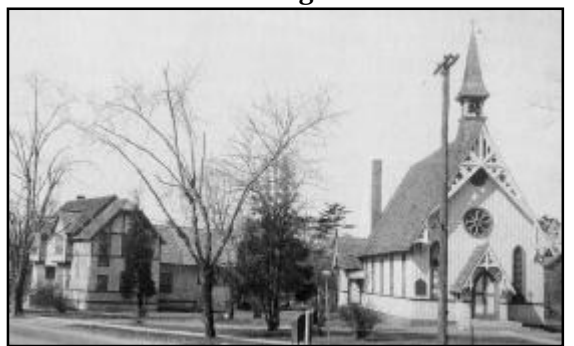
Ca. 1930 Grimstead photograph of the 1893 Parish House (at left) and St. Luke's Episcopal Church