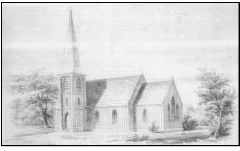
Sketch from Upjohn's Rural Architecture, 1852

Church records indicate that some of Metuchen's most influential local families were members of St. Luke's and its various committees. It is not coincidental, then, that many of the church's members were also associated with organizations such as the Metuchen Club and upperclass leisure activities often seemed to have dominated the congregation's social life. The Metuchen Club provided teas, tennis, and a host of social events, and was located south of the church on Middlesex Avenue, in the building now owned by the Masonic Lodge. St. Luke's itself was adjacent to a golf course. According to a 1968 church history,