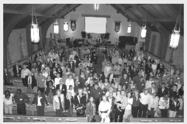
Centennial Event at the First Baptist Church, April, 2008.

The First Baptist Church of 100<sup>th</sup> Metuchen celebrated their Anniversary this year with a program, a dinner and other activities throughout the year. They chose Psalms 78:4 as their theme verse for the year: "We will tell the next generation the praiseworthy deeds of the Lord, His power, and the wonders He has done." The 100<sup>th</sup> Anniversary Committee's goal was to make sure they did not forget the vision of the founding members and all those who continued the work throughout the years.