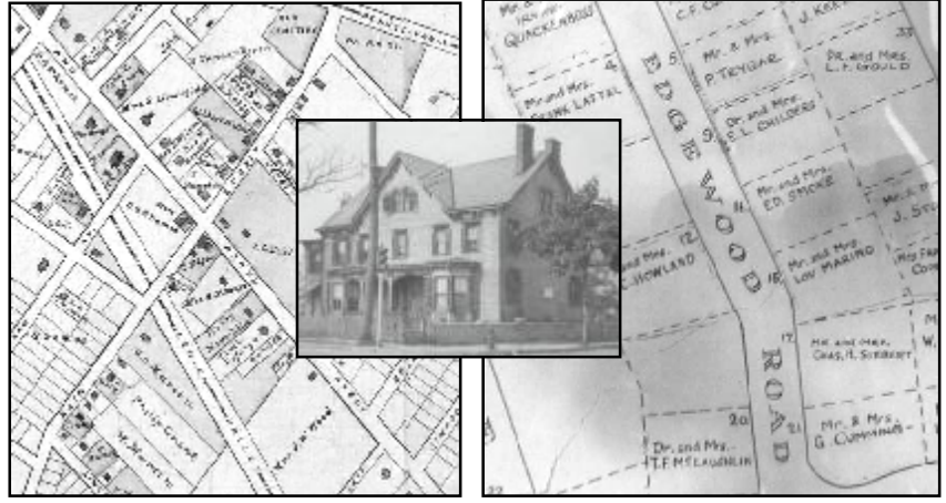
Detailed views of the 1876 W.C. Dripps Map of Metuchen (left) and a mid-twentieth century development map of the Oak Hills Association in Edison (right). The 1932 Grimstead photograph at center is of the northwest corner of Main Street and Amboy Avenue.

The Metuchen-Edison Historical Society's Grimstead Room, located in the Metuchen Public Library, contains a multitude of resources that can assist Metuchen and Edison area homeowners research the histories of their houses. Some of these resources include historic maps, thousands of early photographs, telephone and address directories, real estate prospectus booklets from the turn of the century, and local history research subject files. Shown here and on Page 3 are samples of the available resources. Fund raising efforts are currently underway to assist with making these resources more accessible, and plans are in progress to utilize them in a workshop to be held this spring (see below).